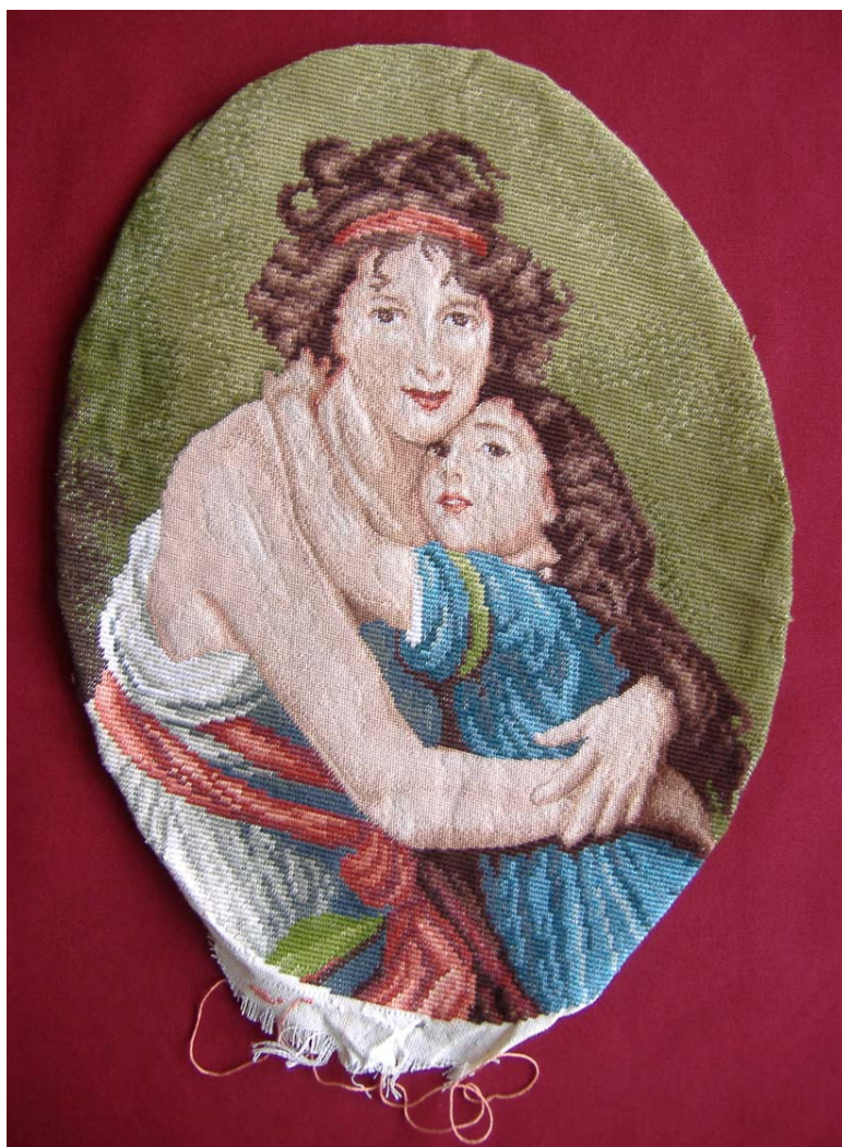
Top right: film still from Grand Mother's Gobelins , 2008